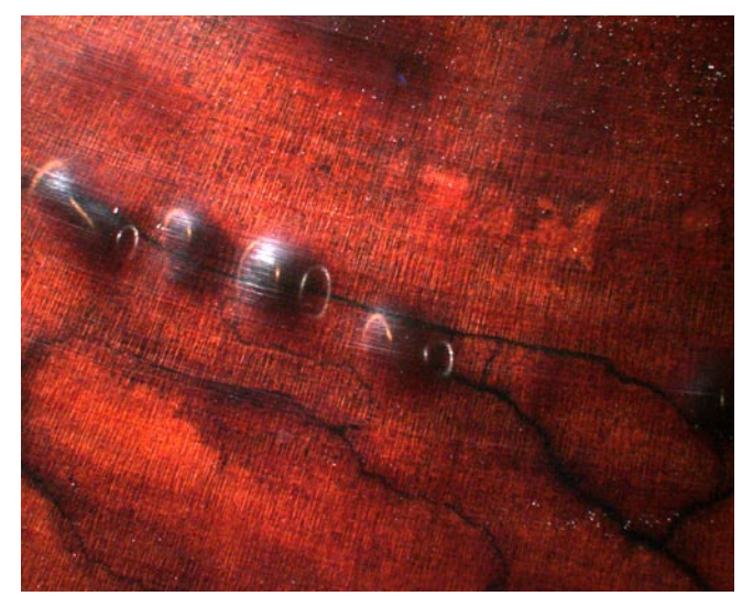
Figure 5. Some blisters followed lines of spalted figure.

The blisters are firm to the touch but not hard. When depressed they are somewhat plastic. One blister was pierced by a syringe needle in order to extract some of the matter in the blister for analysis. Once the matter was removed air filled the void and fluid fingers of the brown matter could be seen radiating from the blister at the wood surface. The now vacant blister did not return flat but retained its shape. Plastic deformation had occurred (fig. 7). FTIR spectra on that sample revealed that the