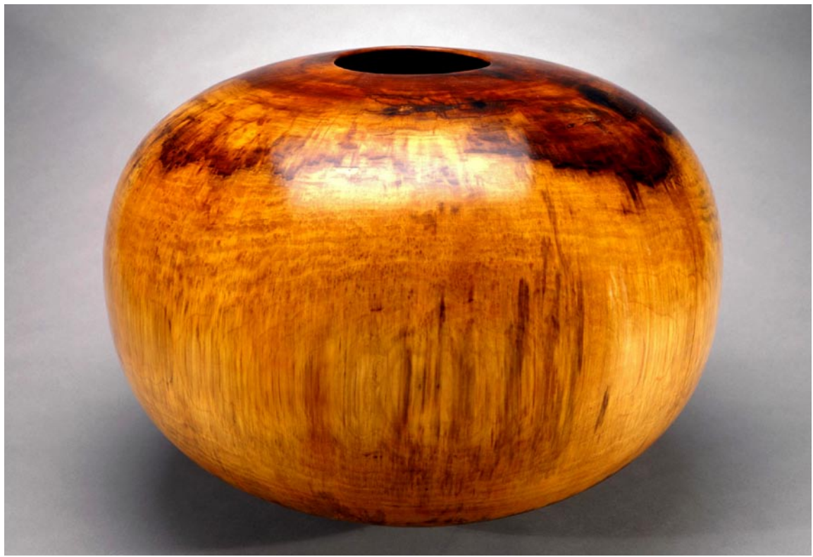
Figure 1. Spheroid, 1988, Figured Tulipwood, The Museum of Fine Arts, Houston, 89.106.