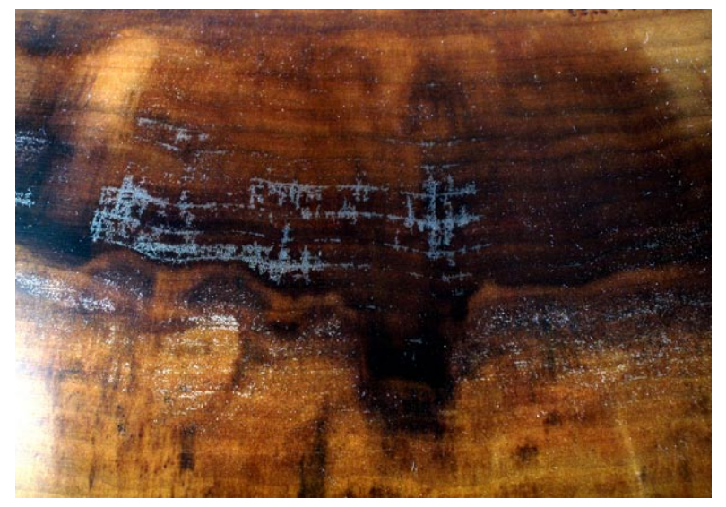
Figure 6. Fractured finish was primarily related to growth rings.

blisters were filled with polyethylene glycols with traces of epoxy resins. ^{\rm 17}