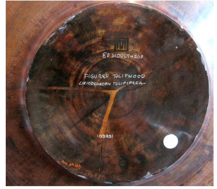
Figure 4. Moulthrop's signature, stamp and labeling.

Epoxy is formed from the mixing of intermediate resin and curing agent in an exothermic reaction. During curing, cross-linking results typically in a glassy resin with a high glass transition temperature (Tg) where the material transforms from a hard glassy state to a more fluid and flexible plastic state.<sup>6</sup> For clear films, the US Forest Products Labs has determined that it is one of the materials resistant to diffusion of water vapor.<sup>7</sup> Low temperatures can slow its curing. Excessive moisture during curing can cause the resin to include the water