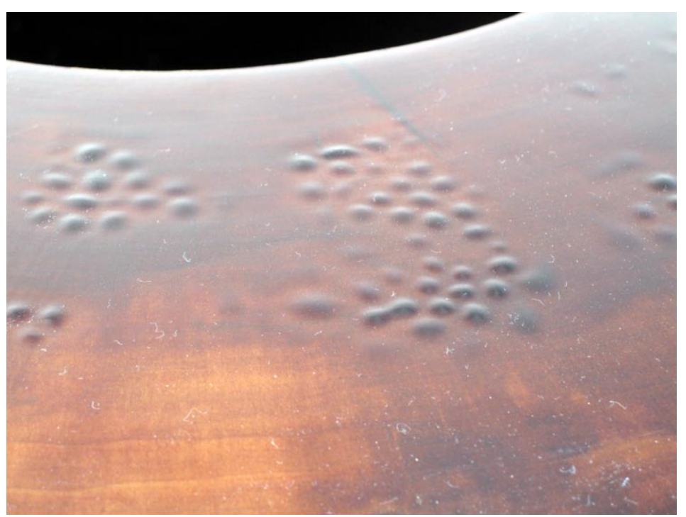
Figure 2. Blisters developed in the epoxy finish 14 years after the bowl entered the collection.

2006 WAG Postprints—Providence, Rhode Island