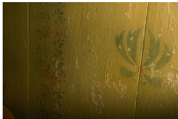
Figure 6. Detail of painted surface on dining room walls in raking light, 1999.

The gesso appeared to be pulling whatever original paint that might have been left off of the wood. Since the overall goal of the treatment was to create surfaces that were harmonious within the house,