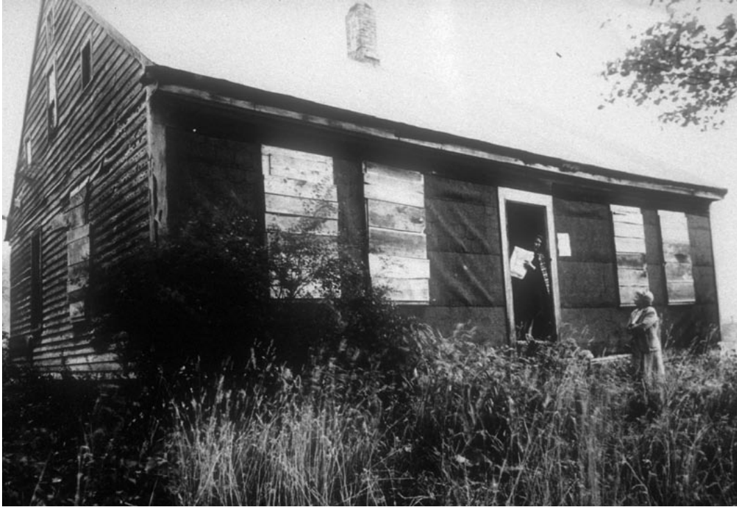
Figure 1. Exterior of the Stencil House in Columbus, NY, 1952.