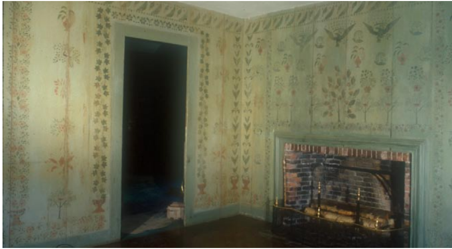
Figure 5. View of two parlor walls, 1990.

I mapped the paneled surfaces either on photographs or on measured drawings with the help of volunteers. We noted the condition of all the paint, the 1950s additions and alterations, and the alterations that were likely to have been made after installation.