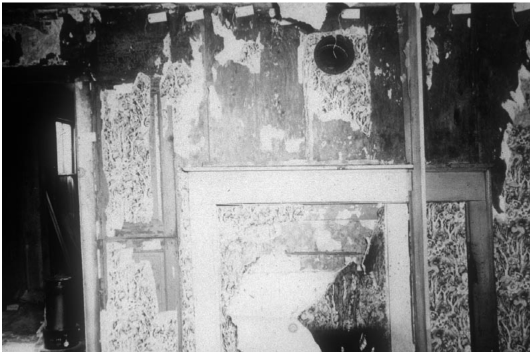
Figure 2. Stencil House dining room before disassembly in Columbus, NY, 1952.