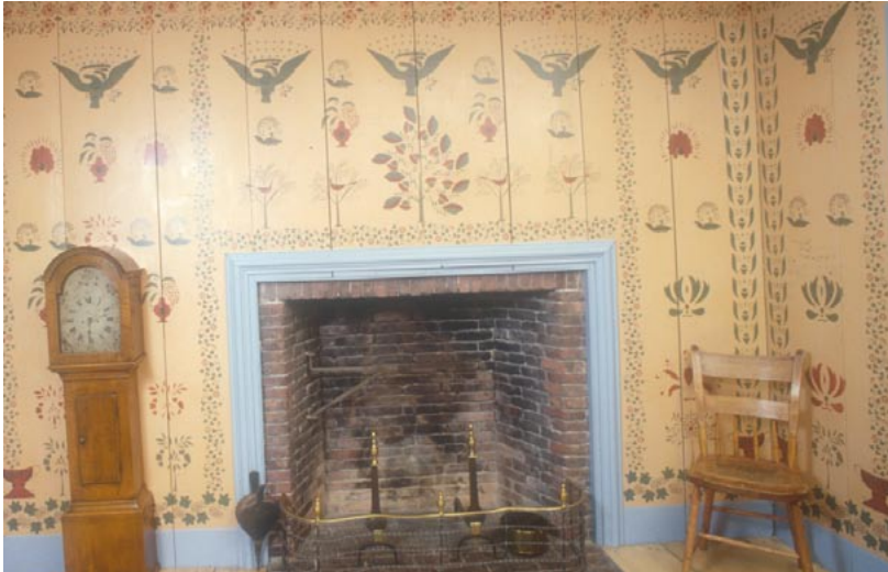
Figure 7. Fireplace wall in dining room after repainting, 2000.

consolidating and overpainting flaking surfaces in the dining room was not a reasonable option. Moreover, since so much original paint survived in the front hallway and parlor and there wasn't sufficient early photo documentation to indicate how much original paint was in the dining room before the room was repainted in the 1950s, the curators and conservator made the difficult decision to recreate this room with museum painters and a decorative painter hired for the project.