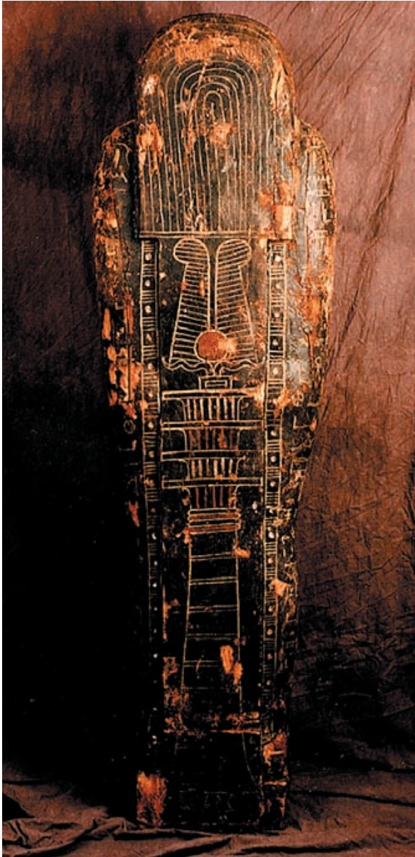
Figure 4 was left in place. No attempt was made to replace any of the lost gesso or green on the face. An oil residue, very possibly the remains of holy oil or some applied oils at the time of burial was found on the PL side of the face running down the side of the coffin. This is almost surely funeral remains and should be left in place. Also remaining was a single, very coarse brush hair on the PR side of the head piece. The brush hair remained in place after treatment.

While cleaning on the PL side of the head and shoulder area, the enzyme cleaning solution,