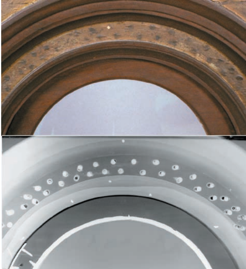
Figure 7. X-ray of front panel, revealing the presence of old sound holes beneath a layer of calcium carbonate gesso and brass leaf paper.

printed but was legible only in a few areas. The use of an infrared camera was able to greatly clarify the text. (fig. 9) The paper refers to the town of Newport and mentions, “the moderation and wisdom of the Count de Vergennes,” possibly referring to the Count de Vergennes, the French minister of foreign affairs who strongly supported the American Revolution and who died in 1787.