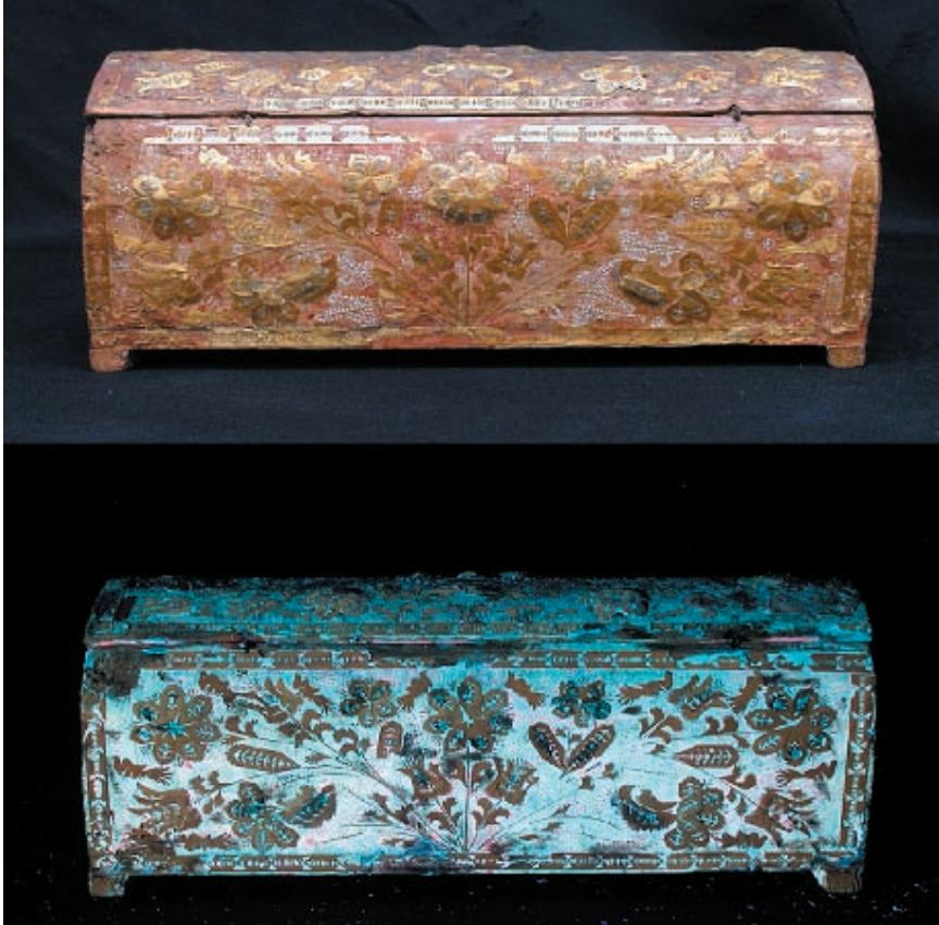
Figure 4. Box with straw marquetry in visible light (above) and ultraviolet light (below).

ing a minute or two before applying weights. (fig. 3) We used a piece of blotter paper with a Hollytex barrier to weight the area. Because the paste is so adhesive, very little was needed to adhere the paper to the wood. Any tiny amounts of paste that were pushed out by the weights did not stick well to the Hollytex.