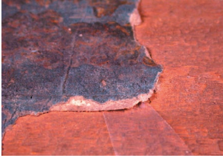
Figure 2. Lifting paper with a small Mylar barrier.

projecting wood splinters that could easily be detached in handling.