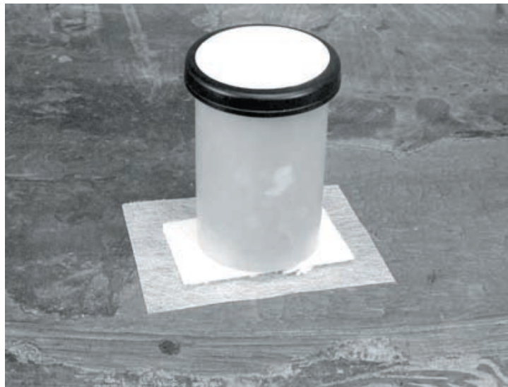
Figure 3. Applying weight.

We used Mylar strips as barriers between the paper and wood to avoid accidentally applying the paste to nearby surfaces (note the Mylar strip in figure 2). We then allowed the paste to dry further, wait-