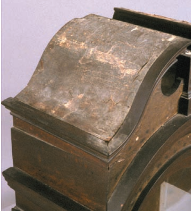
Figure 8. Clock hood showing the paper dust cover.