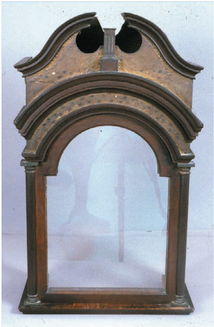
Figure 6. Clock hood, showing the gilded paper in the pediment and the arch above the door.

The dust cover on the top of the clock was extremely discolored and detaching from the wood of the clock hood. (fig. 8) The paper had been