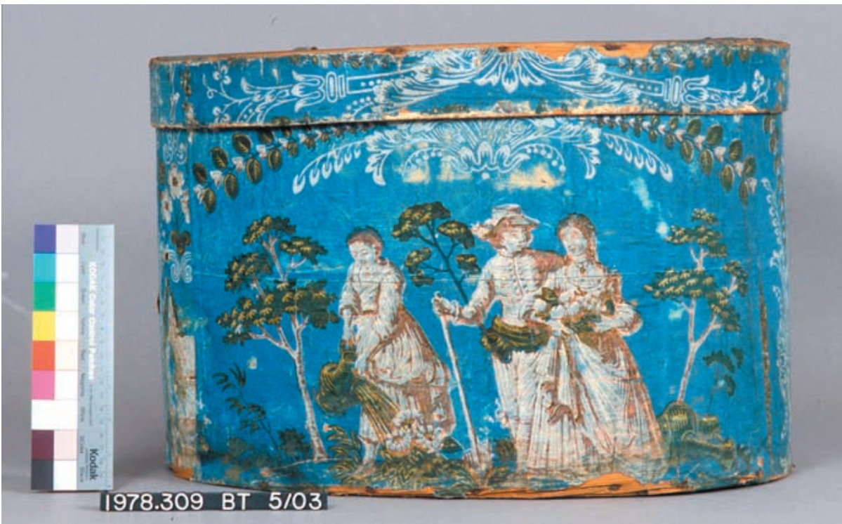
Figure 1. Band box with paper covering.

The technical examination of paper on furniture can be carried out using a variety of different tech-